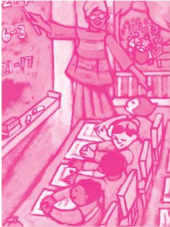
Illustration copyright © 2002 by Shelagh Armstrong. Used by permission of Kids Can Press from If the World Were a Village: A Book About the World's People by David J. Smith.

an animal science unit that could extend into animal research projects. A unique style of looking at word choice makes it a valuable resource for writing and listening activities. AM