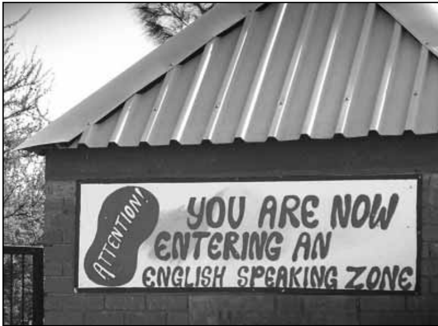
Theresa Rogers, 2005

The teachers' final suggestion is that they should model speaking behavior better in and out of class. This point is related to what many junior secondary schools in Botswana have proposed — the school environment as an English speaking zone. The photograph below illustrates this point: